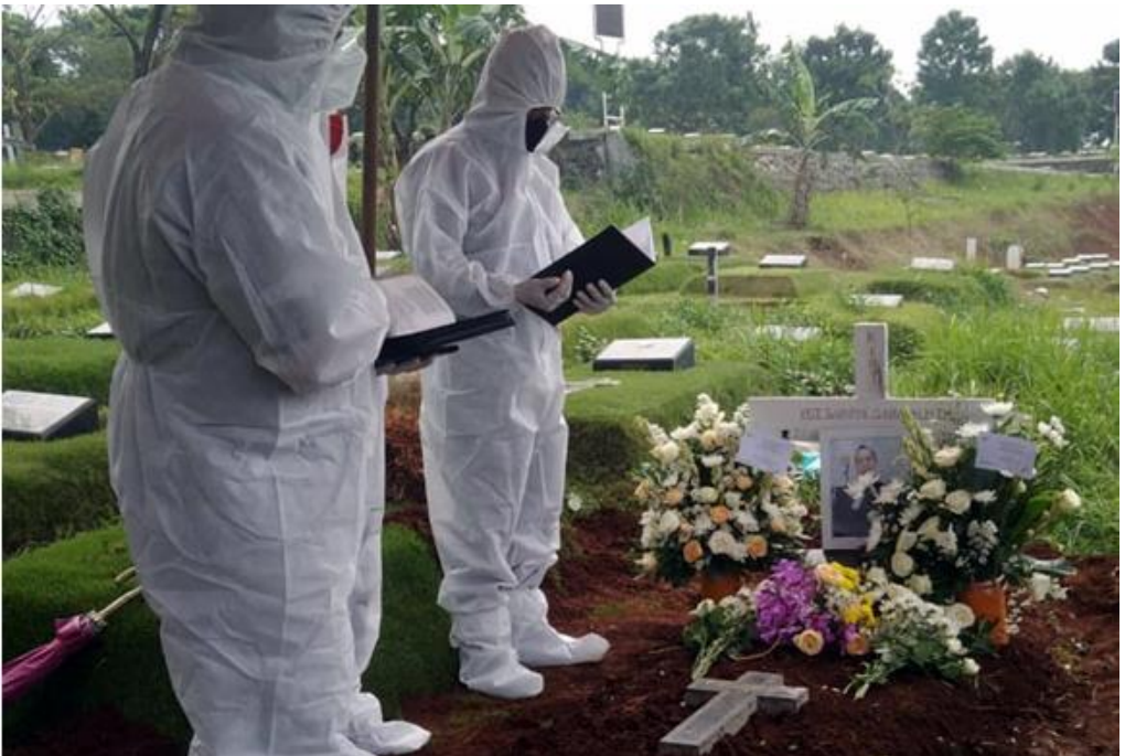
In Indonesia, GKPS pastors in full PPE farewell a fellow pastor, a victim of COVID.

Please pray for Lutheran Pastors around the world.